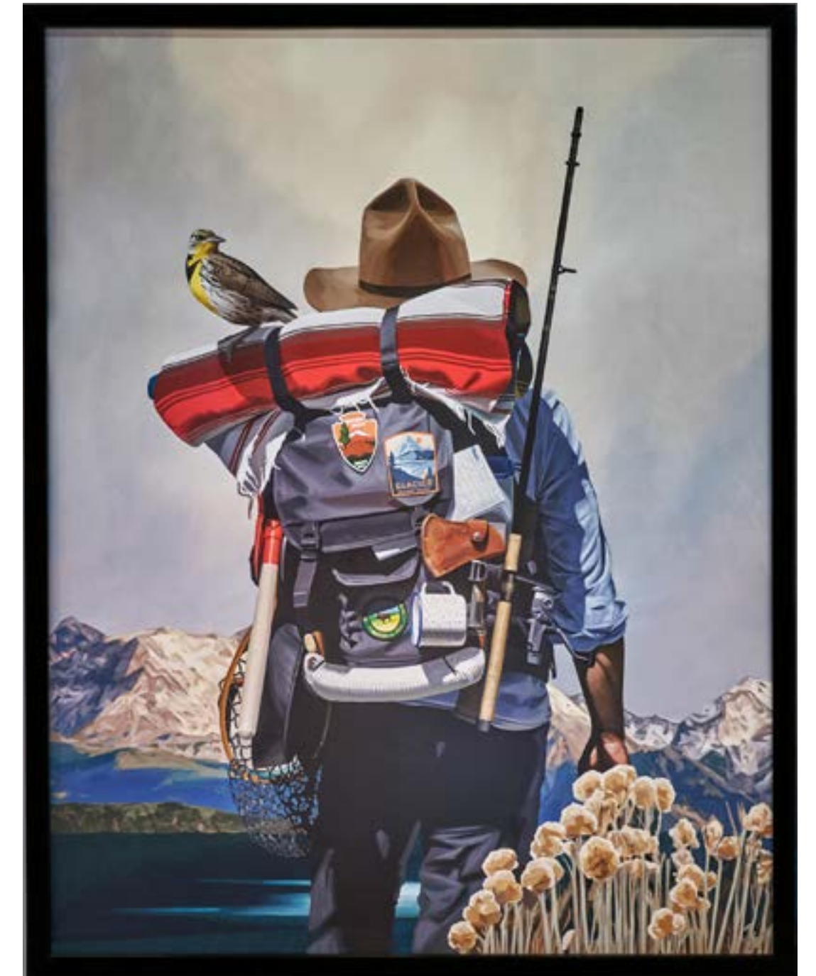
David Rice Untitled , 2021 Acrylic on canvas

David Rice is a painter and muralist based in Portland, Oregon, whose work is an exuberant assembly of humans, animals, foliage, shapes, and patterns, with a dash of magical realism and plenty of jaunty colors. His large-scale paintings and building murals can be found in Sweden and across the United States. Rice was commissioned to create four unique, colorful paintings in his distinctive style featuring local references. From the explorer, whose backpack features a Yellowstone National Park patch and fishing gear, accompanied by a Western Meadowlark bird, to the American Black Bear and Antelope surrounded by Ponderosa pines, each painting by Rice celebrates Montana's natural beauty and splendor.