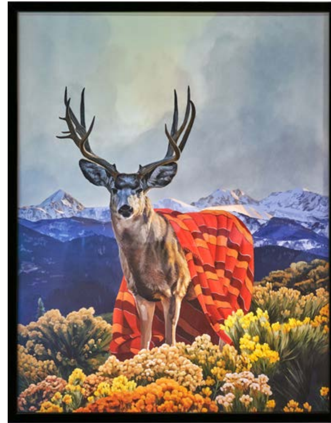
David Rice Untitled , 2021 Acrylic on canvas