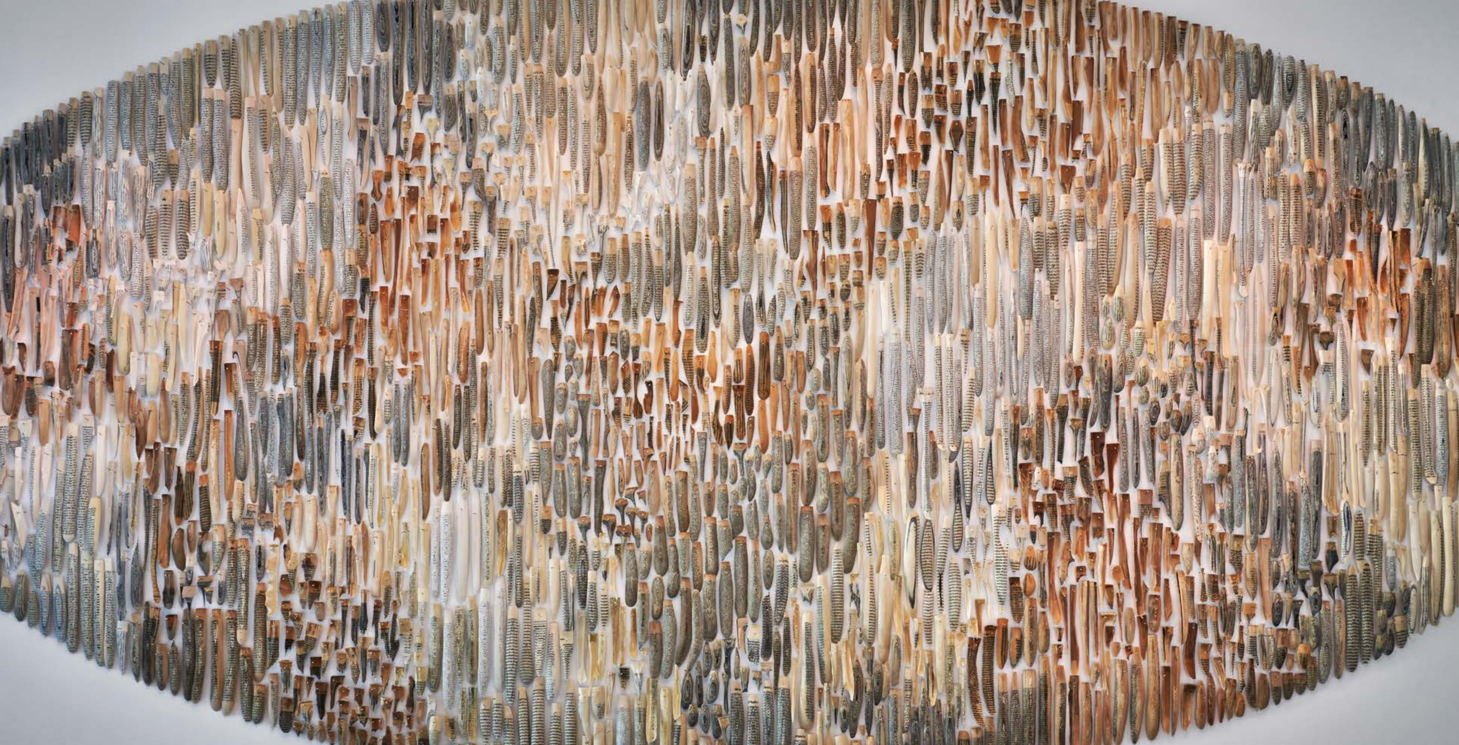
Jessica Drenk Bibliophylum , 2021 Books, wax, pins