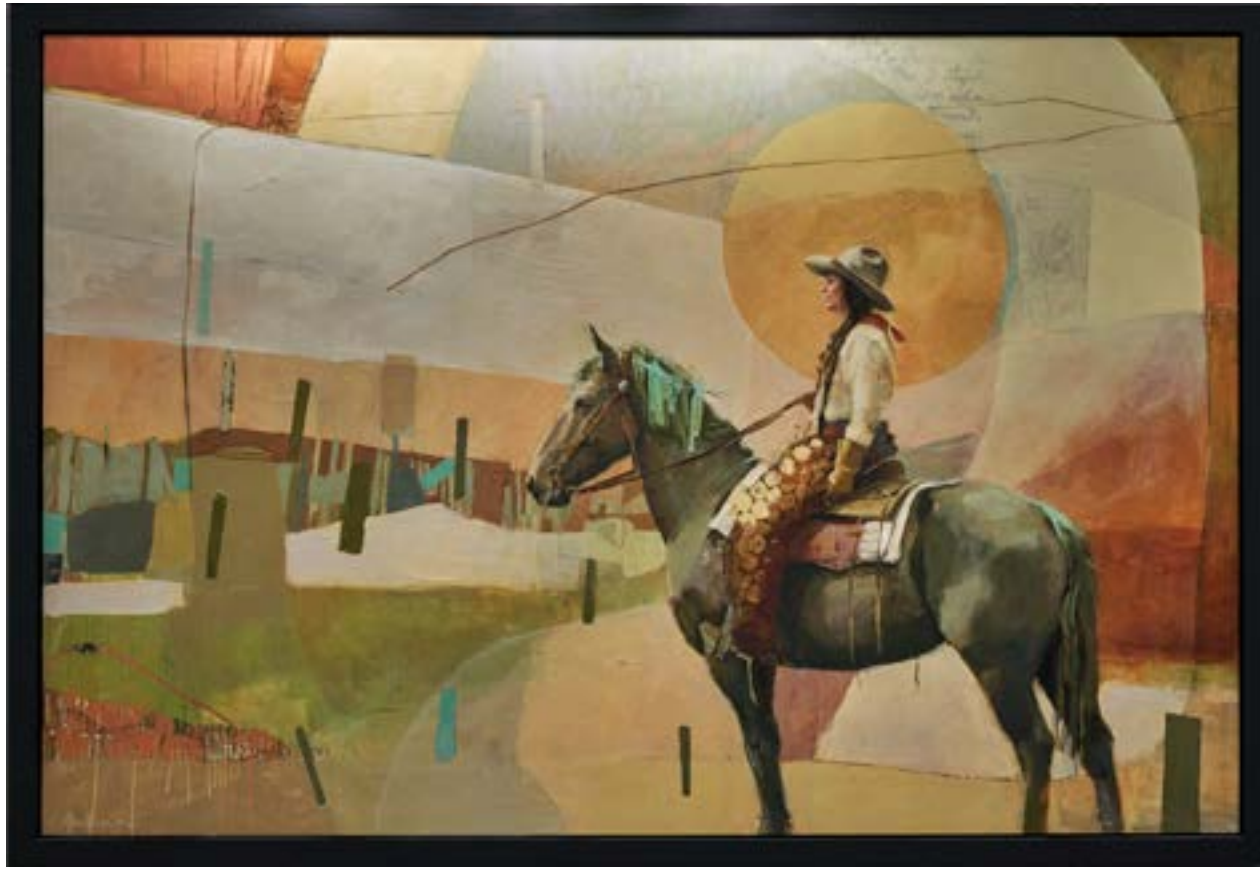
Amy Brakeman Livezey Untitled, 2021 Mixed media on panel