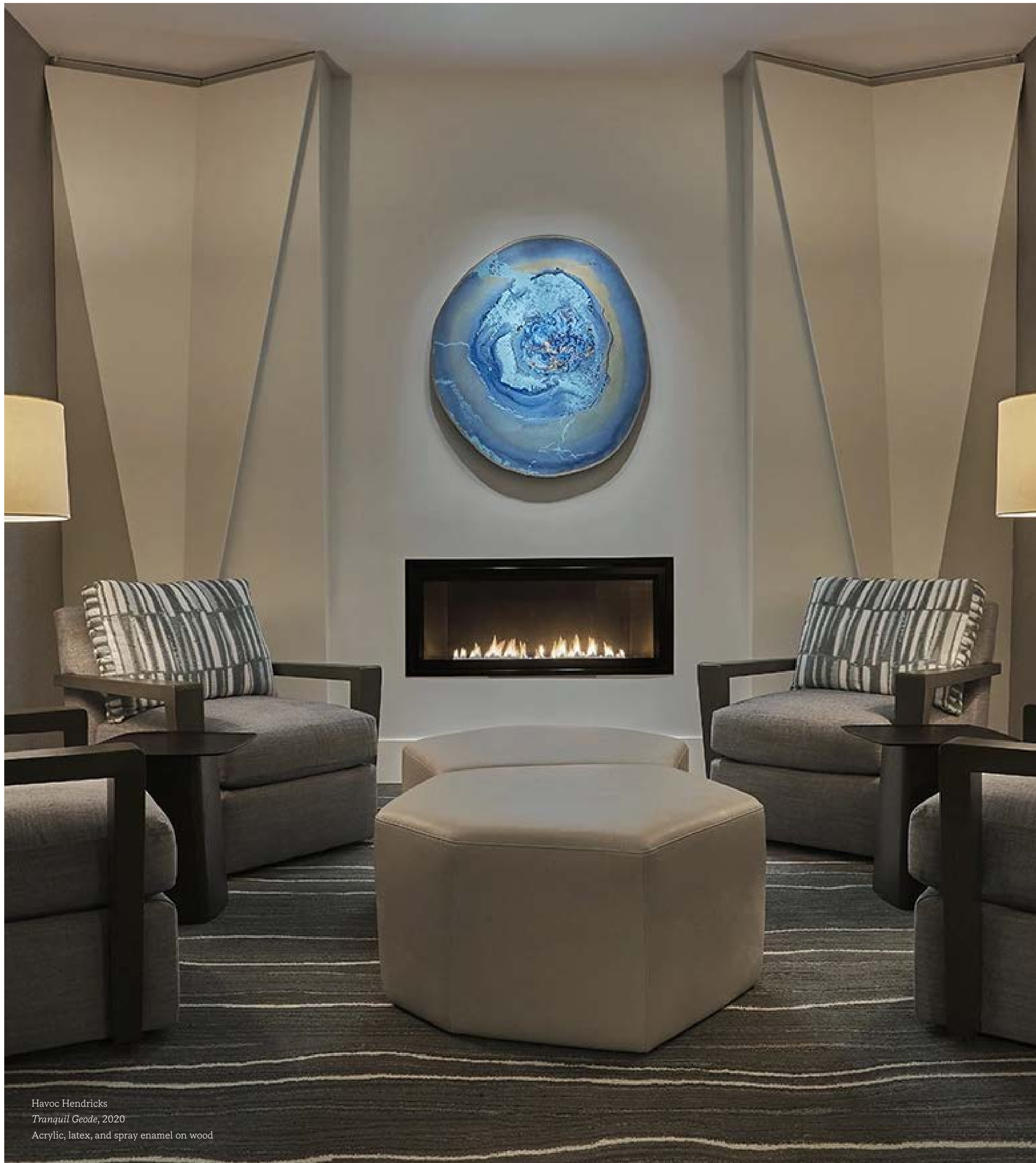
Havoc Hendricks Tranquil Geode , 2020 Acrylic, latex, and spray enamel on wood