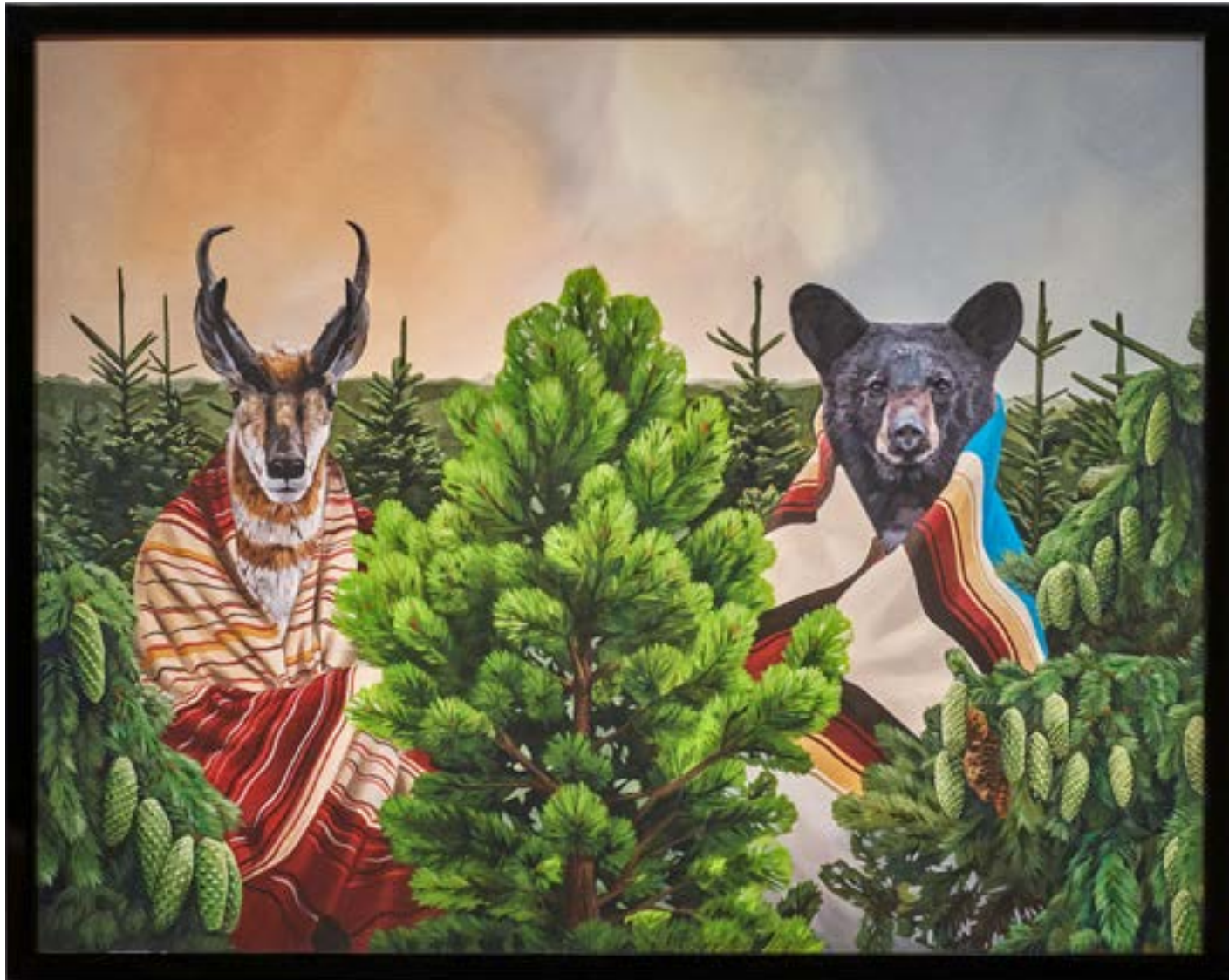
David Rice Untitled , 2021 Acrylic on canvas