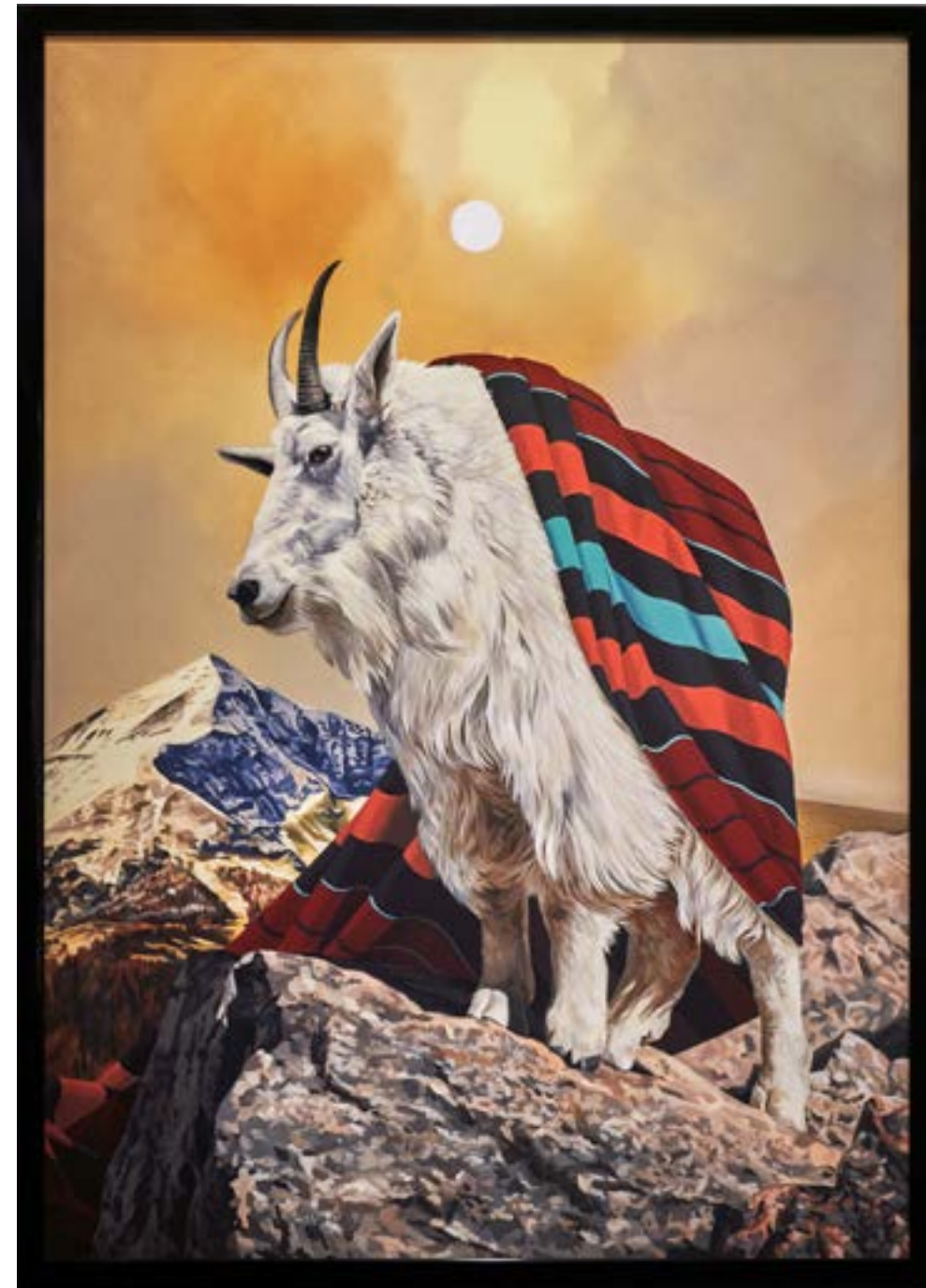
David Rice Untitled , 2021 Acrylic on canvas